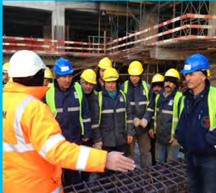
Tool box talk on site with the group of contractors. The Crescent Development Project.