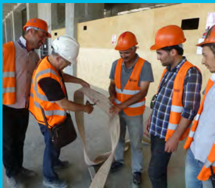
AECOM is cutting the condemned slings. The Crescent Development Project.