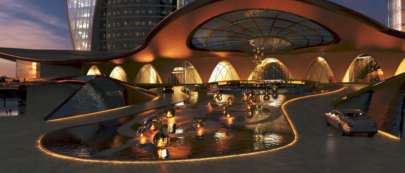
THE CRESCENT COMPLEX Baku, Azerbaijan Mixed-use: hotel, commercial, residential, retail 420,000 m 2