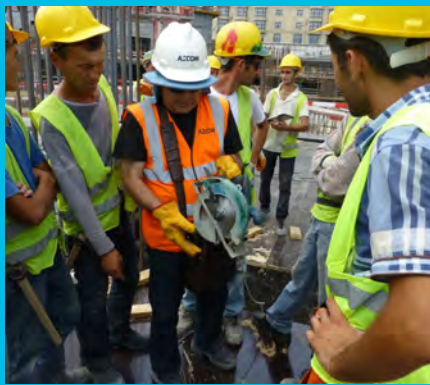
Onsite training "Safe use of the angle grinding machine". The Crescent Development Project.