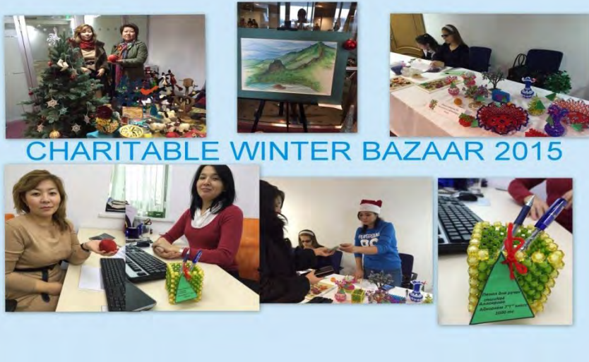
CHARITABLE WINTER BAZAAR 2015

We bought many handmade items and toys presented by various centers of children rehabilitation, boarding houses and educational institutions.